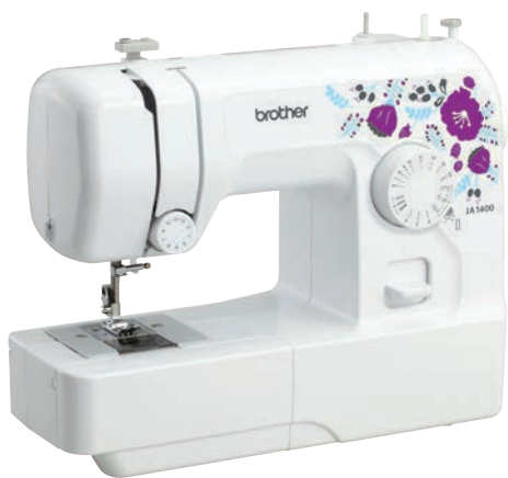
JA1400 14 Stitches