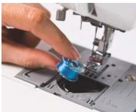
Quick-set bobbin – just drop in a full bobbin and you are ready to sew