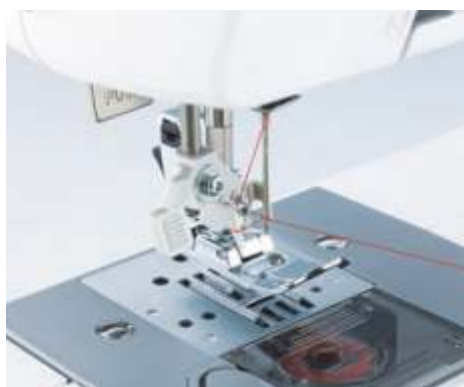
Easy automatic needle threading