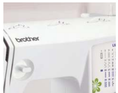
Stitch length and width adjustment

For more informations see your dealer or visit www.brother.in